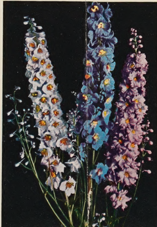
Wrexham Strain Delphiniums